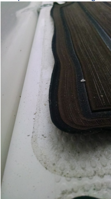
Example of extreme burning